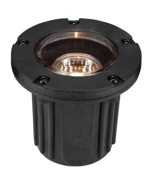
Drive-over rated for 2,205 lbs