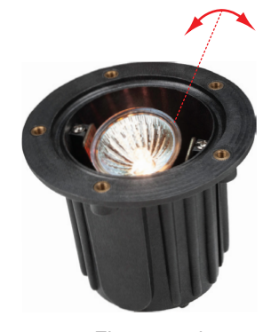
Fixture socket tilts for ± 25°