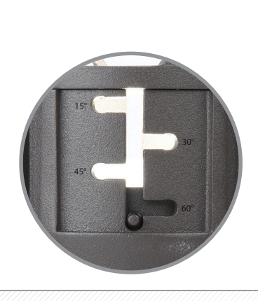
Adjust Beam Angles Presets at 15°, 30°, 45°, 60°